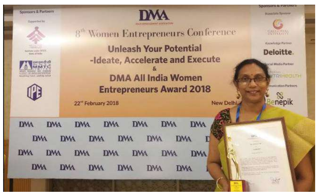
Experience, Experience & Experience!!!

Books & Wi-Fi in a Coffee Shop, Shopping while flying, Reclining Chairs in theatres, etc., are few examples in which Experience is given more importance than Real product or Service.